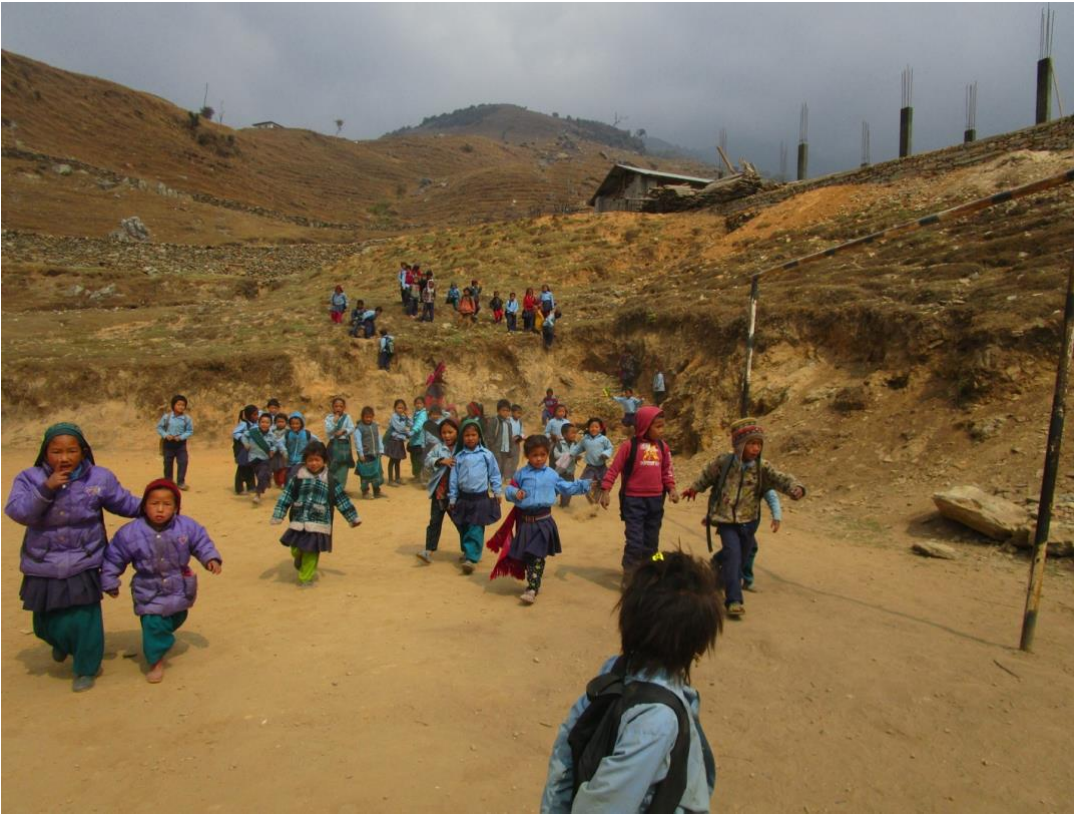
Students from Jaljhukhola Secondary School