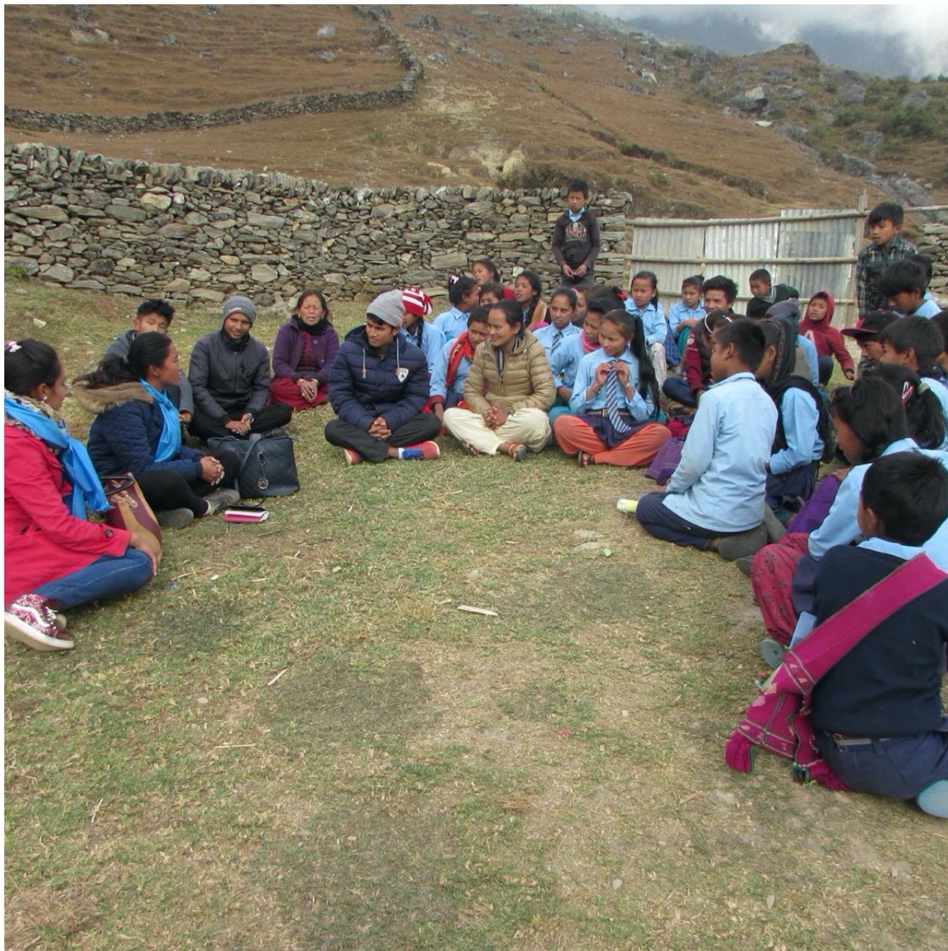
Meeting with the students, teachers and the community members