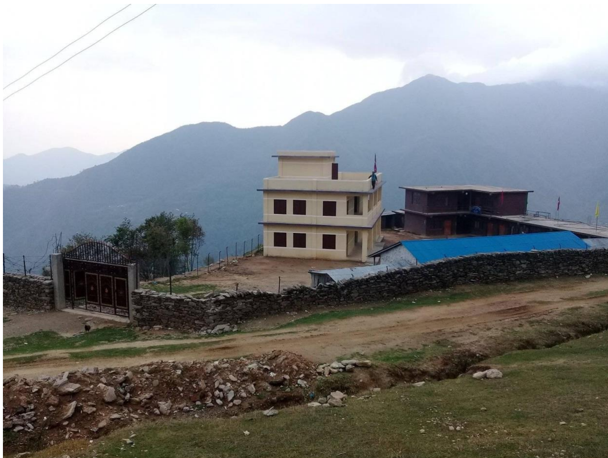
Shree Jalju Khola Secondary School